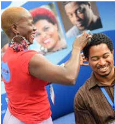
INPEX® 2014 Show Exhibitor