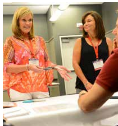
Inventor Presenting to Hampton Direct