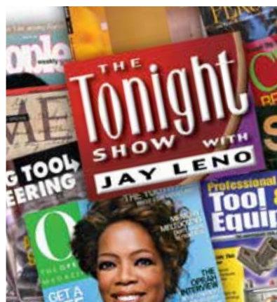
INPEX® Publicity Coverage * Results are not typical for all exhibitors