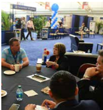
INPEX® VIP Lounge