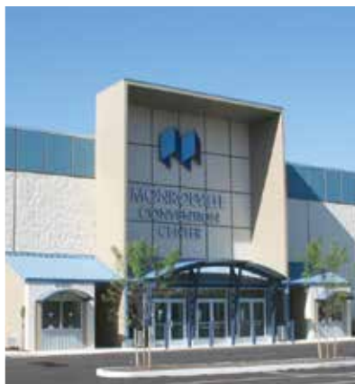
Monroeville Convention Center