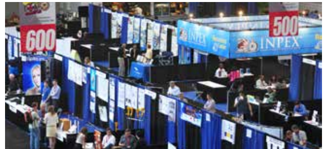
2014 INPEX Show Floor

MONROEVILLE CONVENTION CENTER MONROEVILLE, PA • JUST OUTSIDE PITTSBURGH, PA