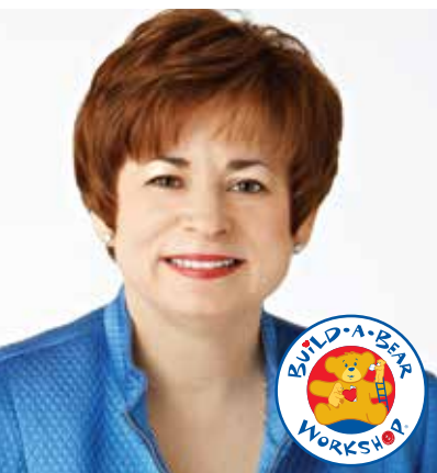
2014 Keynote speaker, Maxine Clark Founder of Build-A-Bear Workshop