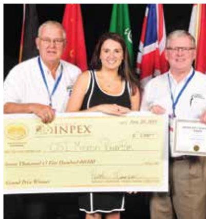
INPEX® 2014 Grand Prix Winner OSI Micron PowerPak