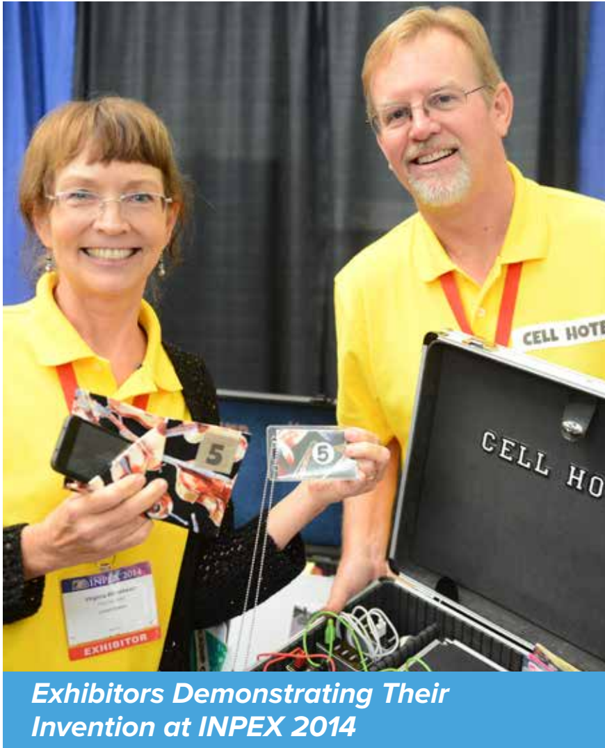
Exhibitors Demonstrating Their Invention at INPEX 2014